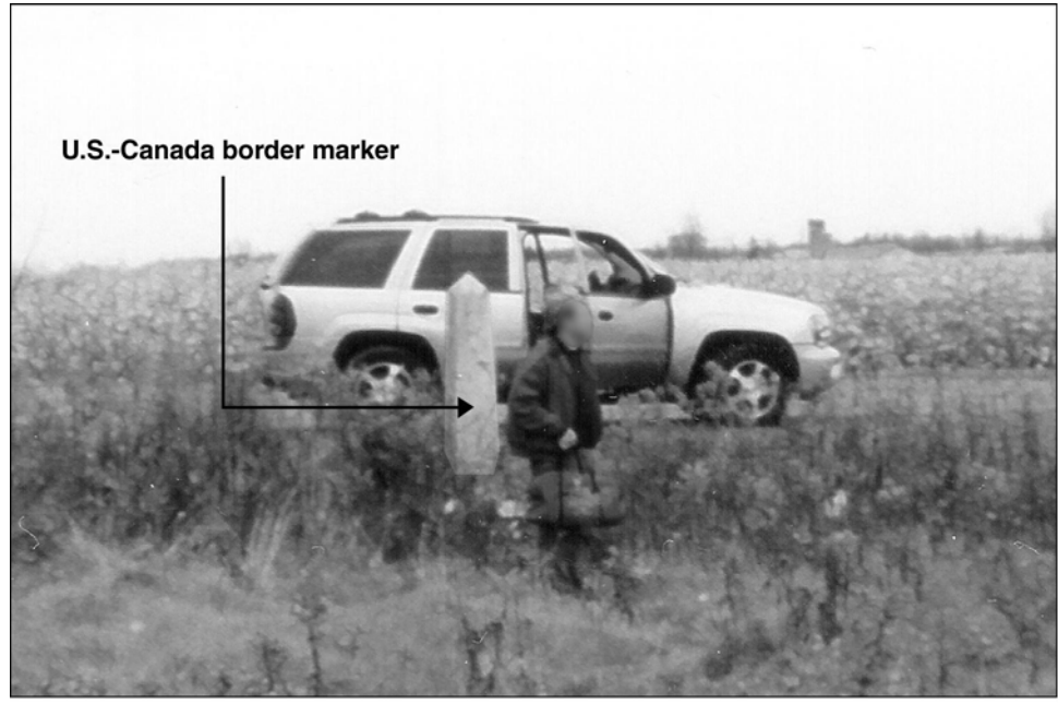
Figure 1: GAO Investigator Crossing from Canada to the United States in Northern Border Location One

the investigators on the U.S. side, and returned to his vehicle on the Canadian side (see fig. 1).