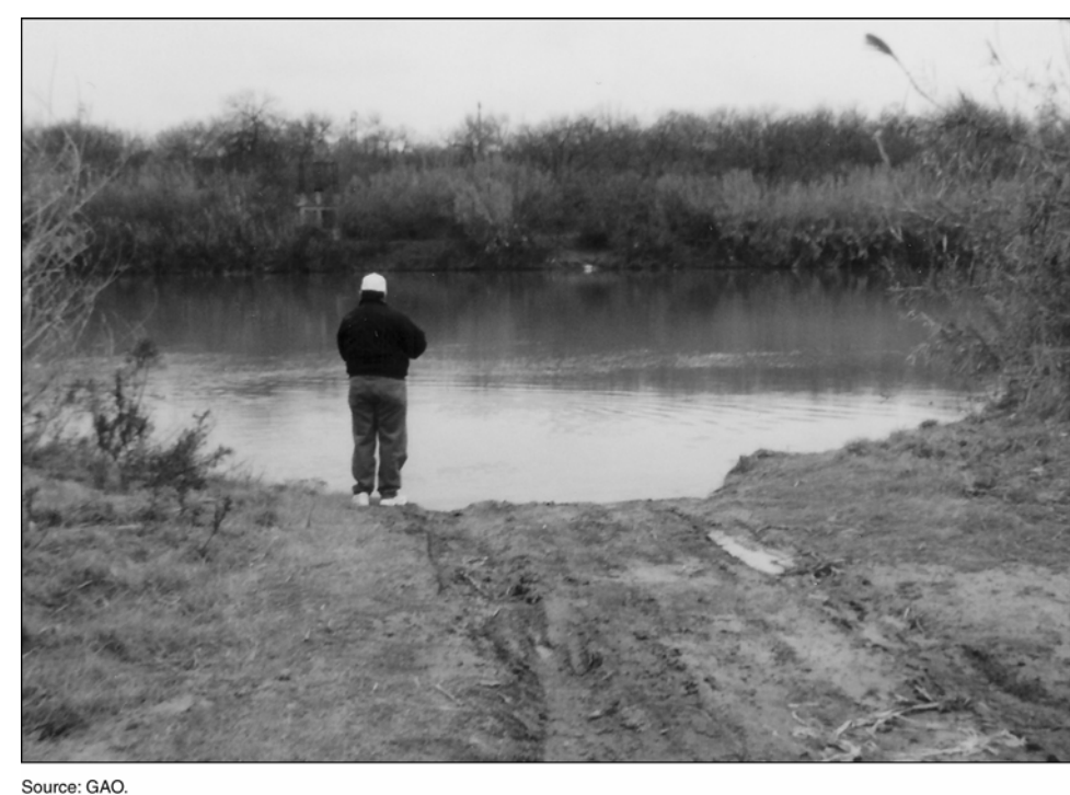
Figure 4: GAO Investigator at a U.S.-Mexico Border Location

An individual who worked in this area told our investigators that at several times during the year, the water is so low that the river can easily be crossed on foot. Our investigators were in this area for 1 hour and 30 minutes and observed no surveillance equipment, intrusion alarm systems, or law enforcement presence. Our investigators were not challenged regarding their activities. According to CBP officials, in some locations on federally managed lands, social and cultural issues lead the U.S. Border Patrol to defer to local police in providing protection. This sensitivity to social and cultural issues appears to be confirmed by the provisions of the memorandum of understanding between DHS, Interior, and USDA.