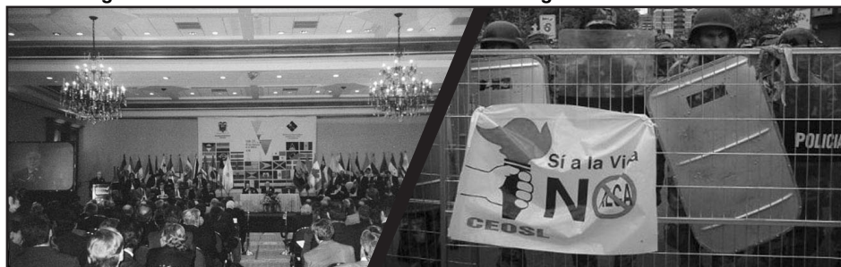
Members of Americas Business Forum meet inside during 2002 Quito Ministerial (left) as police secure outside area against anti-FTAA demonstrators.